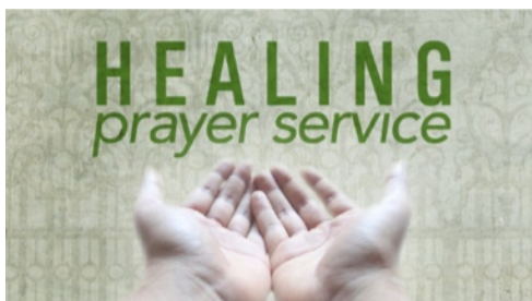
Healing Prayer Service