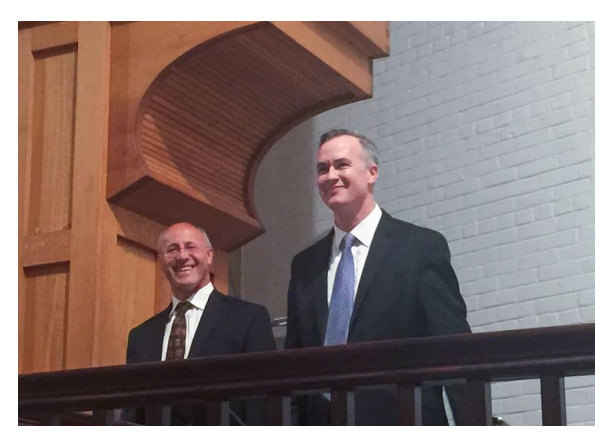
Organ Rededication Concert!

Many thanks to those who are in the choir loft on Sundays. If you love to sing, please consider this notice as an invitation to join the group. Rehearsals are on Sunday morning at 9:15am. Thursday night choir rehearsals will be on September 13 and 20 from 7-8:30pm.